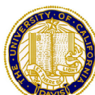
UNIVERSITY OF CALIFORNIA AT DAVIS