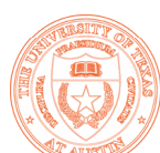
UNIVERSITY OF TEXAS