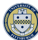
UNIVERSITY OF PITTSBURGH