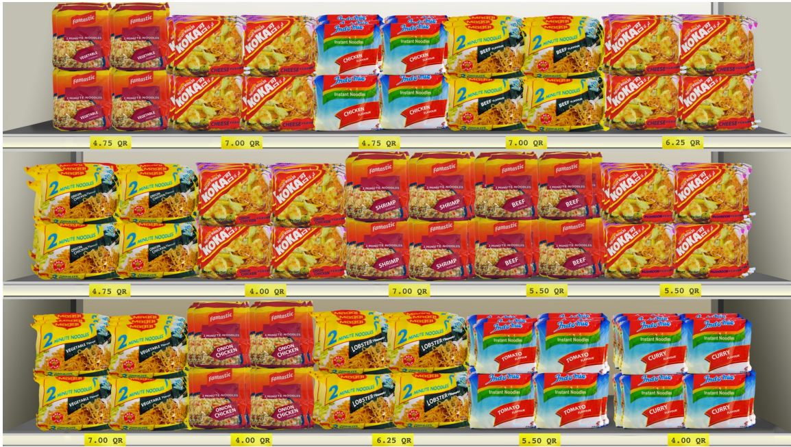
Figure 1: Example stimulus

We choose instant noodles (also known as “Ramen noodles”) as the product category. Products vary on price, flavor, and brand. We use four brands, five equidistant price levels (ranging from \sim \$1.10 to \sim \$1.90 for a five pack of noodles), and ten flavors. The brands and flavors were selected from brands and flavors present in the local market. Similarly, the price levels span the price range found in the local market. The conjoint design consists of 15 choice sets with 15 alternatives each. We translate each choice set into an image of three shelves with five alternatives each. To approximate a realistic amount of clutter on the shelves, each alternative has four facings. See Figure 1 for an example. We used a 50 inch HD television (1920 x 1080 pixels) in the experiment, which allowed for the products to be approximately real-life sized and made all information easily readable.