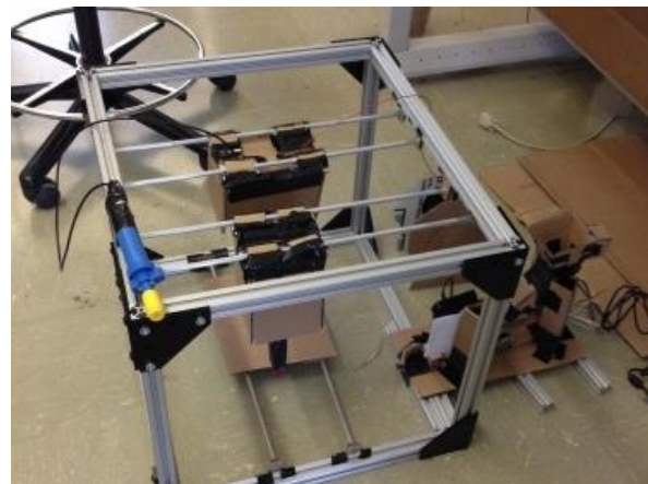
Figure 1: Top left is a graph showing signal voltage as a function of potentiometer angle. Bottom left is the CAD model showing our overall system design. Right is a photo of the mockup created out of aluminum 80-20 and cardboard.