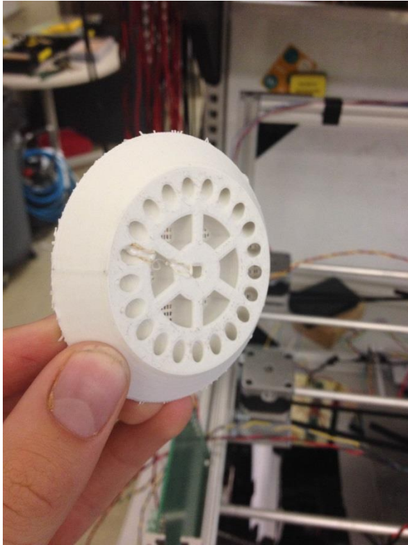
Figure 1: Revolver