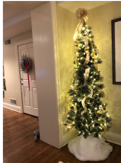
Some of the apartment decorations