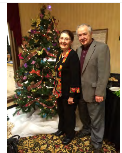
MJB & GCB in bygone times