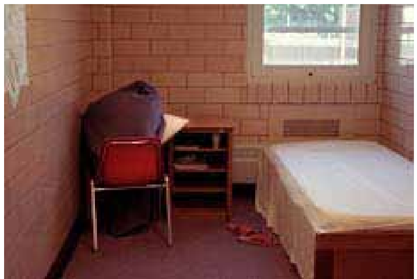
Image showing one girl in her room at Danville

The somewhat infamous conditions at Danville seem rather counter intuitive to the stated mission of The Girls Program, or any of the other programs that Danville advertises for that matter, and I wonder whether there is not another way to hold or house these young girls as to better facilitate the goals set forth by The Girls Program in rehabilitating the delinquent girls at Danville and reintegrating them into society as positive and productive contributors.