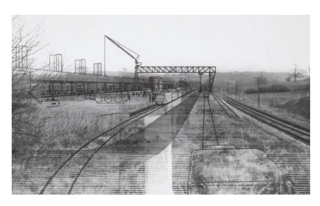
Is Space Political? or: Campus, the Architectural Form as Critique of the Urbanized Polis