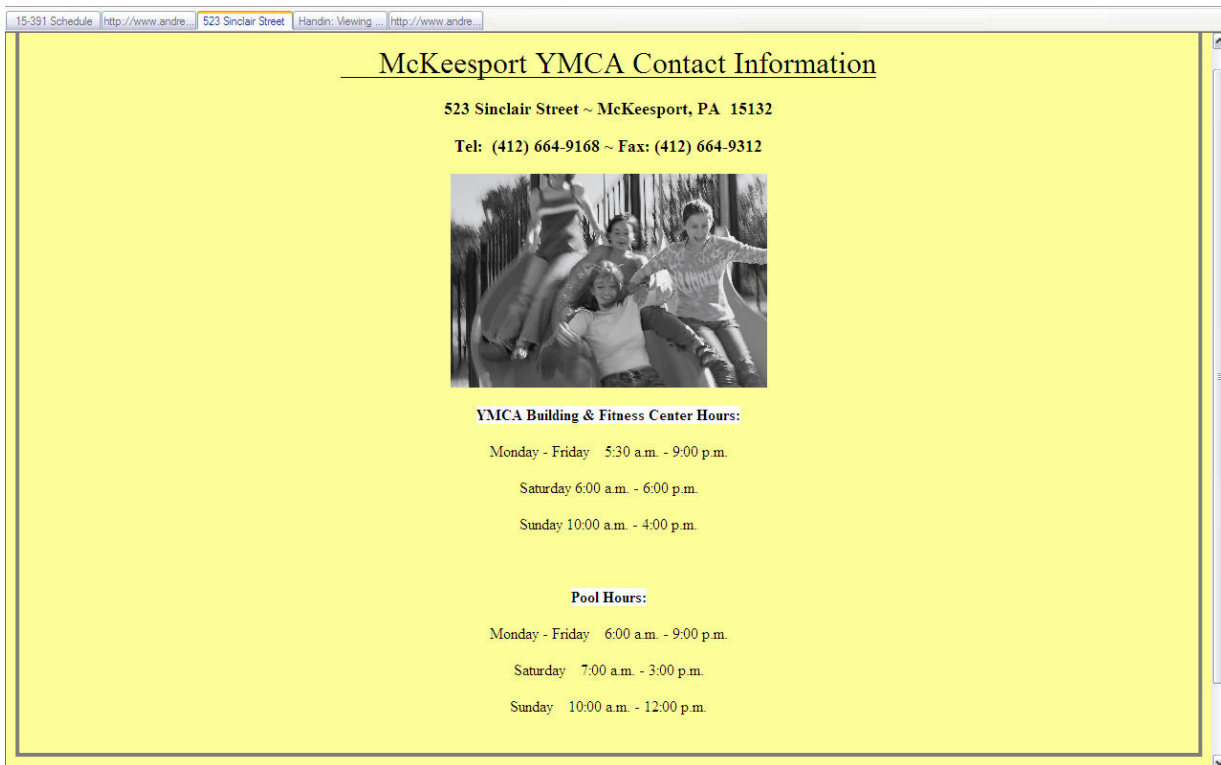
4. Contact Information Page (Created by Dawn & Sandra)