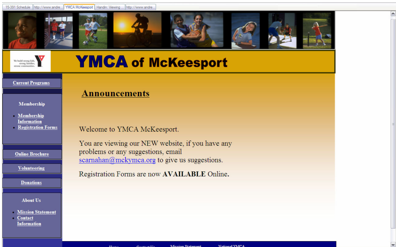
1. Homepage of the McKeesport YMCA's website.