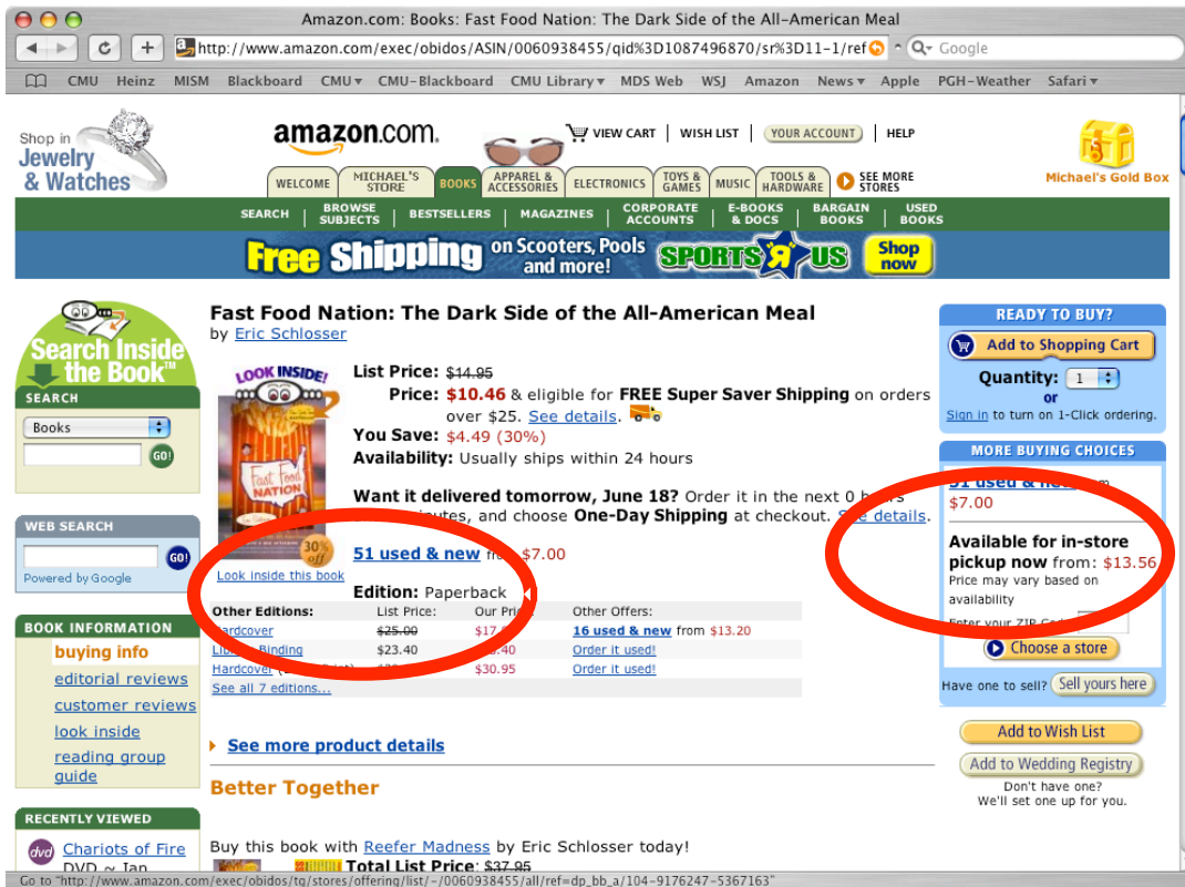
Figure 2: Sample New Book Listing at Amazon.com