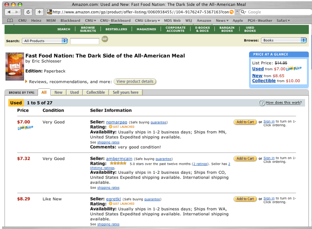
Figure 3: Sample Used Book Listing at Amazon.com