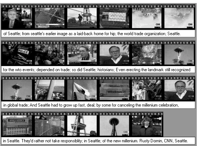
Figure 2. Storyboard with interleaved text, compressed to fit as a single line caption for each image row

If space still exists per row, pick the most important remaining word from the row's full transcript text, expand it to its enclosing phrase if possible, and add to the row text.