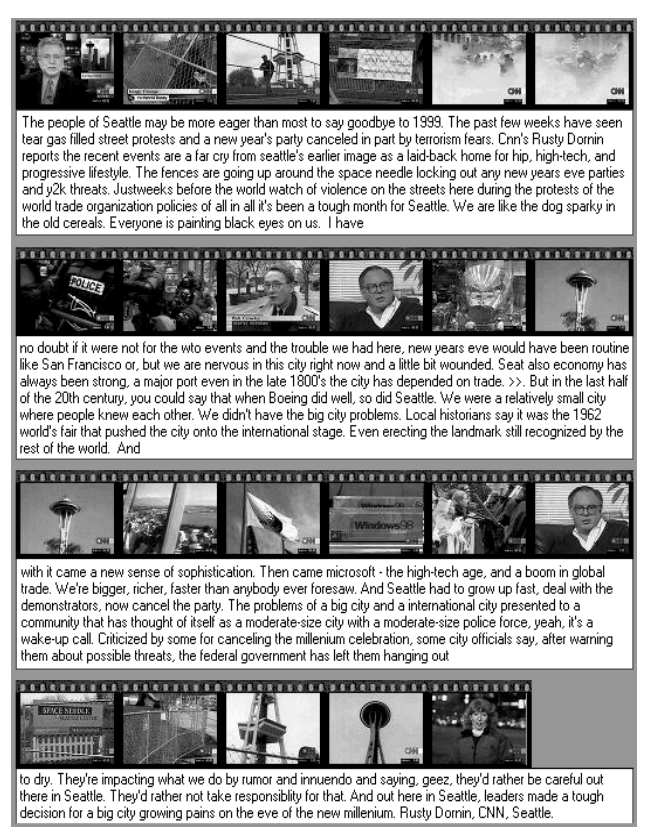
Figure 1. Storyboard image with interleaved transcript undergoing no reduction

the image row, in agreement with most pictorial figure text captions appearing beneath the imagery. These pilot tests resulted in the choice of MS Sans Serif 8 point font, where a 1024 × 768 resolution 19" monitor was used. We investigated interleaving on a per-shot (per-image) basis, but pilot users expressed frustration at the unevenness of text distribution across shots (some shots may have a lot of dialogue and others none at all), and the fragmentation of the transcript into tens of small text pieces. This is in agreement with earlier work on video skims that found piecing together small bits of dialogue was not as effective as piecing together longer, phrase-based pieces [2]. Interleaving is hence done on a storyboard row basis rather than an image-by-image basis.