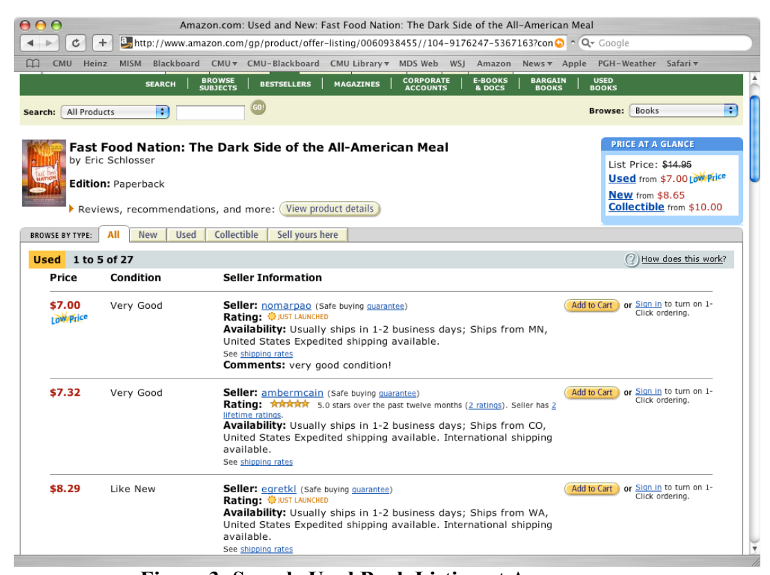
Figure 3: Sample Used Book Listing at Amazon.com