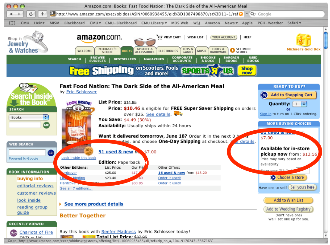
Figure 2: Sample New Book Listing at Amazon.com