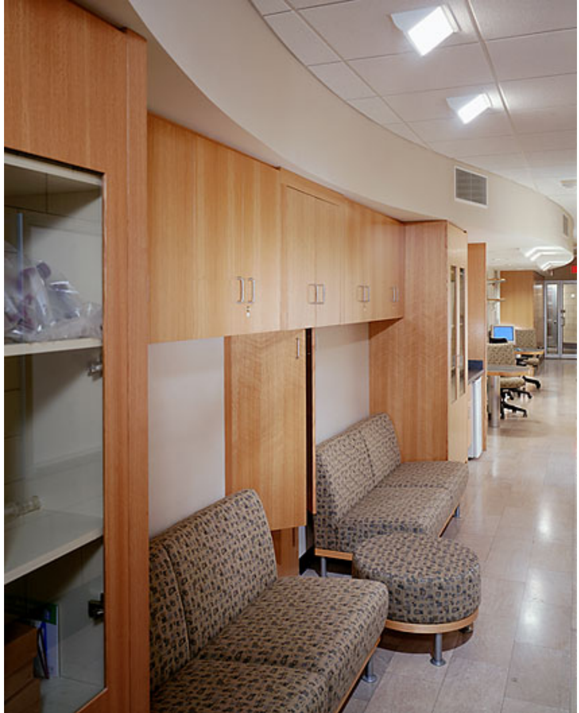
Meeting (relaxing :-) area