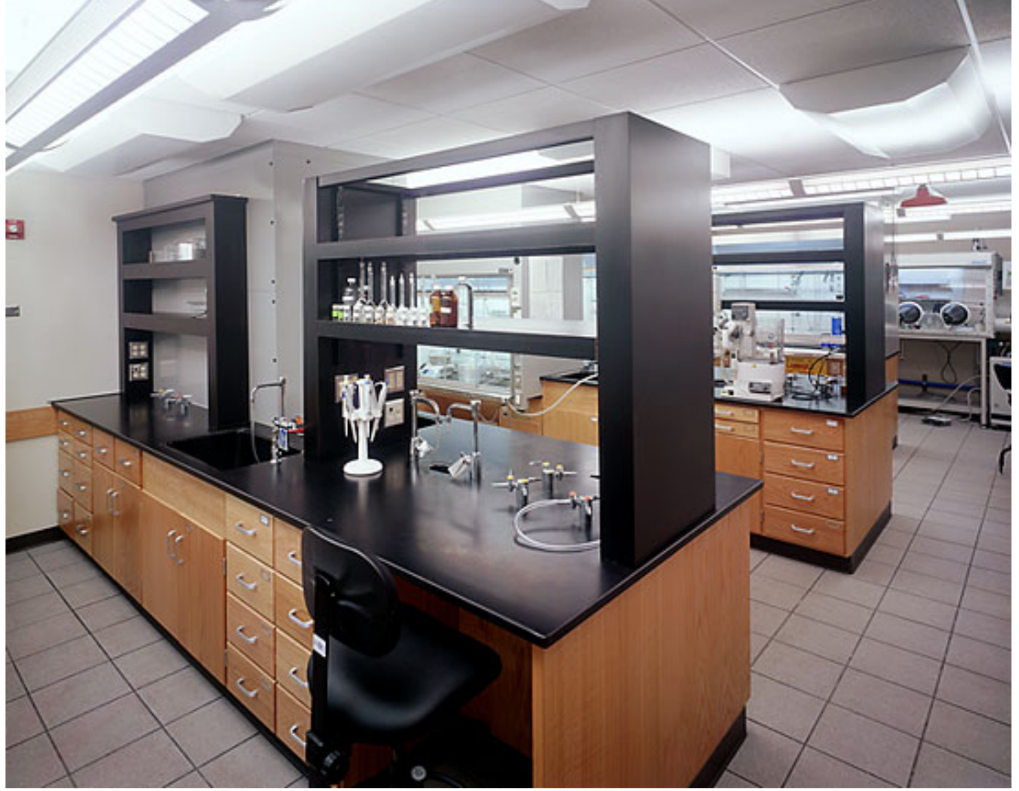
Welcome to the synthetic lab