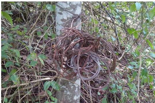
Figure 3: Elephant snare roll found by rangers directed by INTERCEPT.

After our extensive modifications to the CAPTURE model and our subsequent evaluation, it is important to identify the reasons why we obtained such a surprising result: decision trees outperformed a complex, domain-specific temporal model. (1) The amount of data and its quality need to be taken into consideration when developing a model. The QENP dataset had significant noise (e.g., imperfect observations) and extreme class imbalance. As such, attempting to develop a complex model for such a dataset can backfire when there does not exist sufficient data to support it. Our decision tree approach, generally regarded as simpler, benefits from being able to express non-linear relationships and can thus