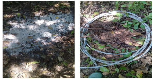
Figure 1: Ashes and snare found by rangers directed by INTERCEPT.

domain, we present the results of a month long real-world deployment of INTERCEPT: compared to historical observation rates of illegal activity, rangers that used INTERCEPT observed 10 times the number of findings than the average. In addition to many signs of trespassing, rangers found a poached elephant, a roll of elephant snares, and a cache of 10 antelope snares before they were deployed (pictures in Figure 1). Each confiscated snare represents an animal’s life saved; while the rangers’ finding of a poached elephant carcass is a grim reminder that poachers are active, these successful snare confiscations demonstrate the importance of real-world data in developing and evaluating adversary behavior models.