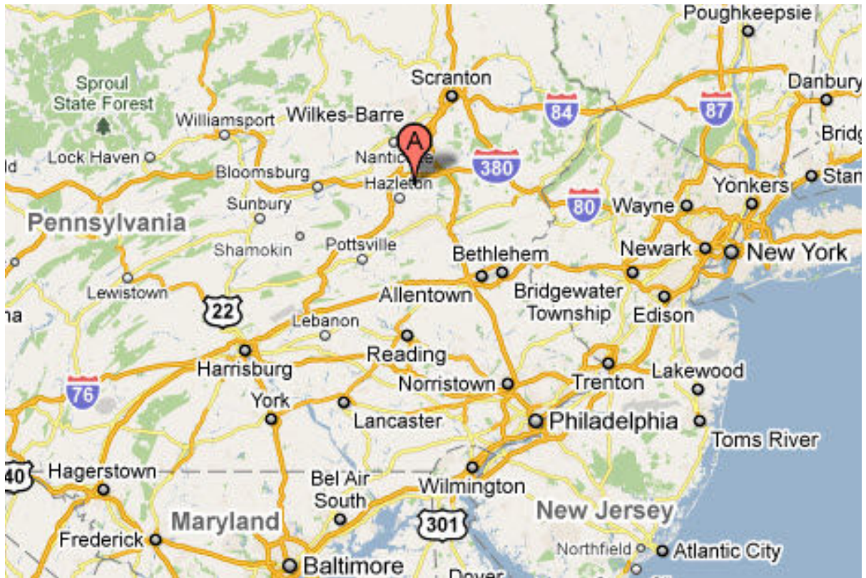
Figure P.1: Contemporary map showing the location of Freeland (marked by the “A”) in relation to the nearby anthracite cities of Hazleton, Wilkes Barre, and Scranton, as well its distance from markets in New York City and Philadelphia.