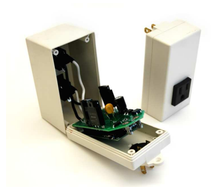
Figure 2: FireFly wireless outlet energy monitoring and control device.

One application running in Sensor Andrew is trying to optimize energy savings through non-intrusive electrical load monitoring of a building in conjunction with user feedback. To support this application, a number of different commercial and research-grade sensing devices are used: (1) Two electrical panels located in the Porter Hall building on the campus were retrofitted with Ener-Sure [2] electric circuit monitors. These devices acquire different power metrics from all the individual circuits in the panel, and can be polled via TCP/IP or RS-232 using Modbus. (2) A number of FireFly [3] power sensing nodes called JigaWatts , shown in Figure 2, are used to measure the consumption of separate appliances throughout the building as a way to obtain ground truth data. (3) Other power meters are used intermittently