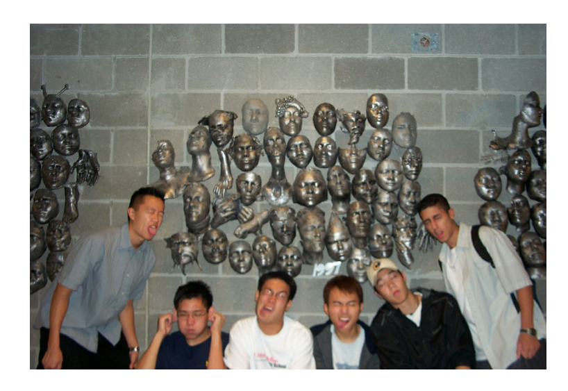
Liang Tzais! Living Testimony group photo... or weird art? Ask Tim Lo!