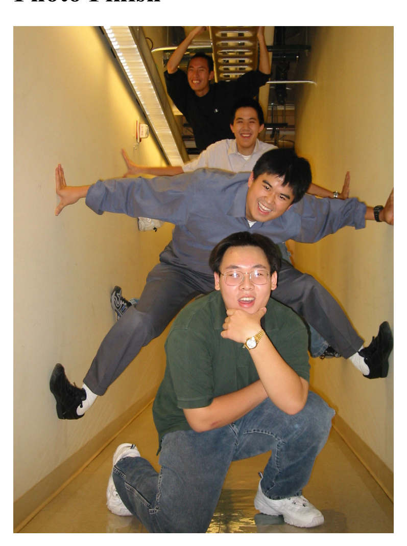
To wrap up the Cell Night Photoscavenger Hunt, you (the ACFers) voted as Best Photo this snap by Panting Deer.

A big "Thank You!" goes out to everyone who contributed!