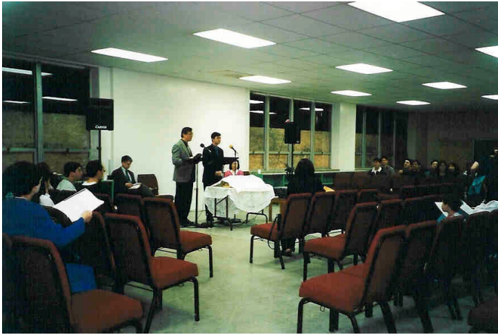
New location, new building, new chairs, new beginnings.

It was a Good Friday indeed. Preparations for the first service held at the Pittsburgh Chinese Church's (PCC) new Perry location were made for 80 people; more than 150 attended. Members of the PCC Perrysville Chinese and English congregations, who anticipate moving into the new building by mid-May, were joined by members of the PCC Oakland congregation and of the Asian Christian Fellowship, a college fellowship associated with PCC, to remember Christ's suffering and sacrifice and to give thanks for God's blessings. Thanks to everyone who labored in love on Project Love!