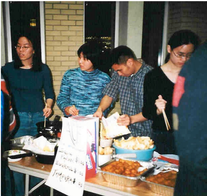
ACF serves up some food, fellowship, and fun by participating in this year's Night Market, a joint event held by many Asian student organizations at CMU.