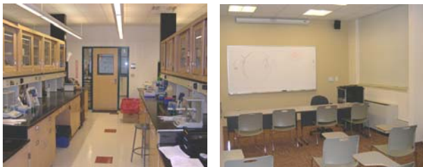
Left. BME student laboratory used by undergraduate BME students. Right. BME student briefing and discussion room. ♦

and Biomaterials and Host Interactions (42-419). BETL has facilities for cell-culture activities (biological safety cabinets and incubators), microscopy (phase-contrast and fluorescence), and various other BME experiments (such as electrocardiography and electromyography). Additional equipment purchases are planned to permit other types of experiments to be performed. The establishment and renovation of BETL will significantly enhance both the undergraduate and graduate curriculum by providing facilities for laboratory experiences that supplement classroom work. Several other BME classes, such as Medical Devices (42-444/744), Rehabilitation Engineering (42-347/747) started using this space (see figures below) in Fall 2009. Many other BME classes are being modified and developed to utilize this important facility.