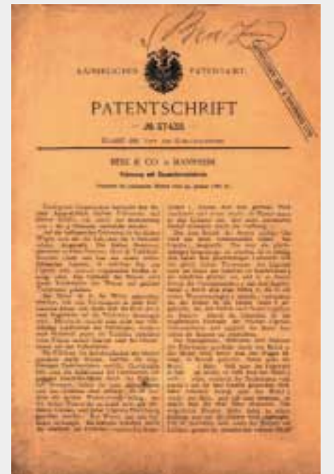
On January 29, 1886, Karl Benz was granted the German patent no. 37435 on his motorized vehicle. This patent marks the beginning of automobilism. It describes the first functional unit of an engine with a chassis – the Karl Benz Patent Motor Car.

By 1888 Karl Benz had been granted another four German patents, among them a patent for a fire-proof carburetor.