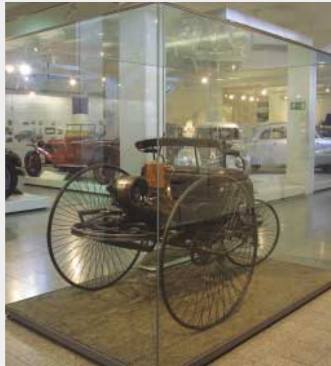
Twenty years after its maiden journey – the maiden journey of the first holistically designed motor vehicle – the Benz Patent Motor Car No. 1 was rediscovered in a distant corner of Benz's automotive factory, scrupulously restored and, on the occasion of its 20th anniversary, donated to the Deutsche Museum (German Museum) in Munich.